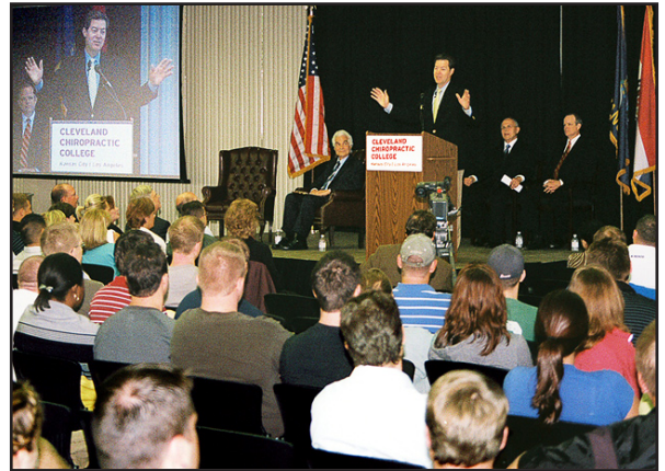
An overflow crowd listens as Senator Brownback explains his health care positions.

In a discussion moderated by College faculty member and Health Insights Today editor-in-chief, Dr. Daniel Redwood, Senator Brownback shared his views on a variety of health care issues. Regarding the current health reform debate, he expressed strong support for market-based solutions while opposing a larger role for government, mentioning health savings accounts as a prime example of the policies he favors. He agreed that prevention and health promotion should play an increased role in health care delivery. However, when asked by student Devin Mobley whether prevention and health promotion services should be reimbursable when delivered by all practitioners trained and licensed to provide them (including chiropractors), he replied that this should be based on cost-effectiveness rather than specific government mandates.